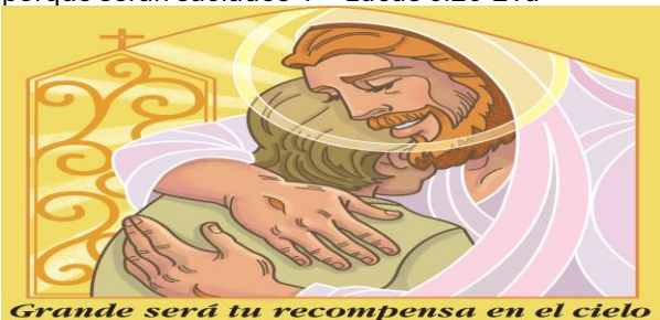
Grande será tu recompensa en el cielo

"Dichosos ustedes los pobres, porque de ustedes es el Reino de Dios. Dichosos ustedes los que ahora tienen hambre, porque serán saciados". — Lucas 6:20-21a